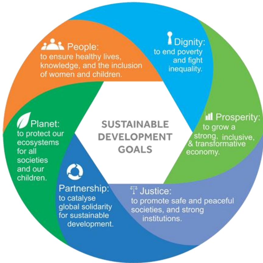
Wangari Muta Maathai/Nairobi ( 06.02.2017 www.european-retail-academy.org/GGU )